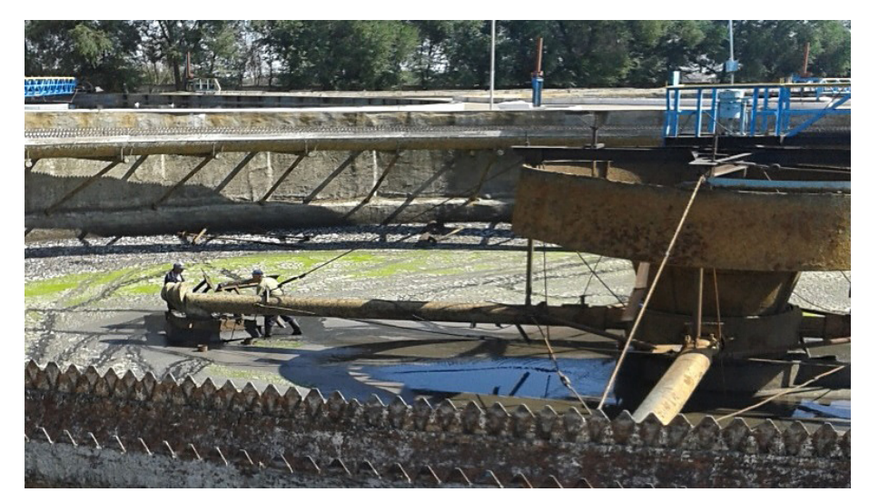
Figure 4. Picture showing replacement of flexible component scoops scraper [Ospanov 2017]