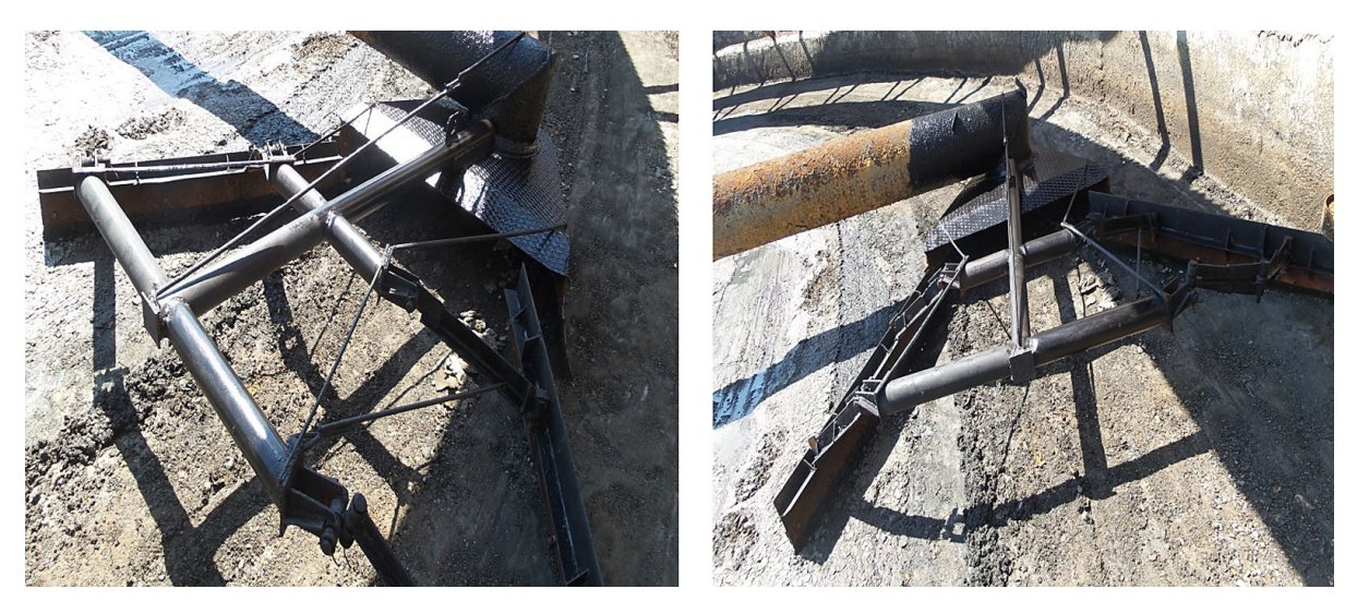
Figure 3. Photo of suckling of aeration station in Almaty [Ospanov 2017]